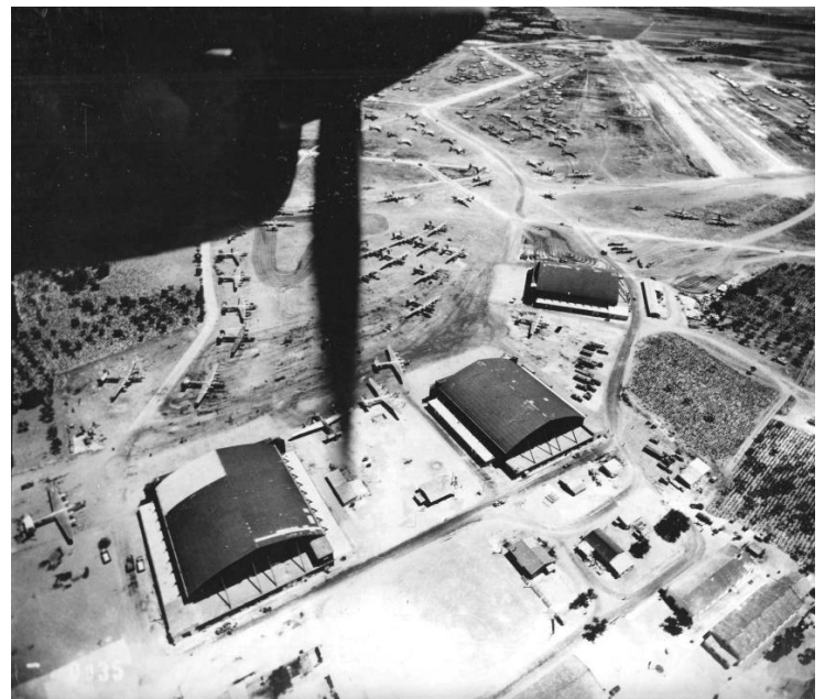
Staging Airdrome No 1

to the Flight Section for a thorough flight test by depot-based pilots. If satisfactory, the engineering liaison officer notified the base personnel processing officer. The crew was alerted and ordered to fly a two-hour fuel consumption test flight. Should it fail, it would have been red-lined and another aircraft pulled from the reserve pool for the flight home. A total of 1,367 aircraft of all types were salvaged, including 264 B-24s, following their failure to pass inspection.