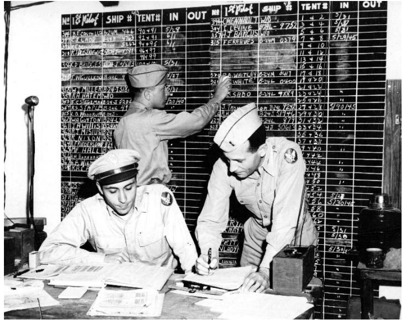
Incoming crews were assigned temporary quarters while out processing. (Photo taken 31 May 1945)

When an aircraft arrived at Gioia del Colle, the crew was picked up by truck, assigned temporary quarters including a cot and blankets, given showers, and sent to the mess hall. What happened from there was 36 hours of processing. It was assumed all out-processing would be completed prior to being assigned to the ATC. Clothing and flying equipment were checked and corrected as needed. Personnel forms were processed, including paybooks, flying records, shot cards, dog tags, medical forms, and other records.